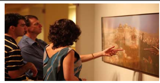
Attendees at the Opening Reception are wowed by the exclusive photography of the Parthenon and the City of Athens, taken by Peter C. Yalanis.